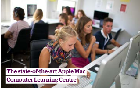
The state-of-the-art Apple Mac Computer Learning Centre