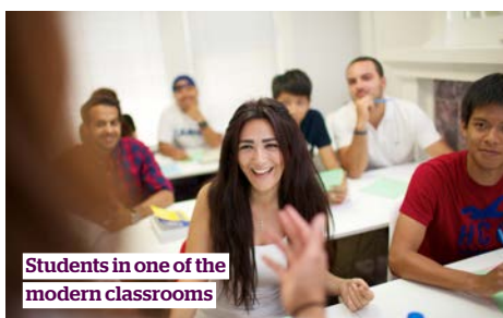
Students in one of the modern classrooms

Kings Los Angeles is located just between Sunset and Hollywood Boulevards, right in the heart of Hollywood. Lessons take place in a stylish building with bright, spacious classrooms and, upstairs, a state-of-the-art Apple Mac computer suite. There is lots of great outdoor space for sitting and relaxing, including an outside decked area.