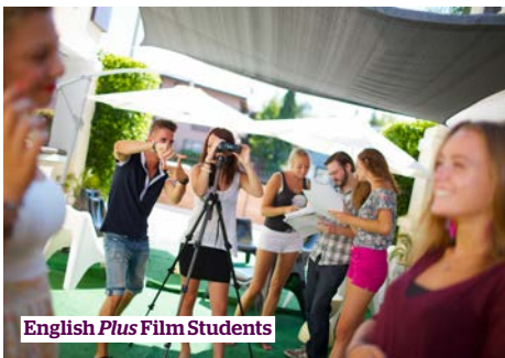
English Plus Film Students