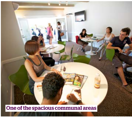
One of the spacious communal areas