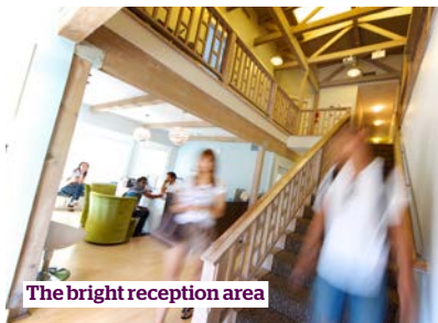
The bright reception area