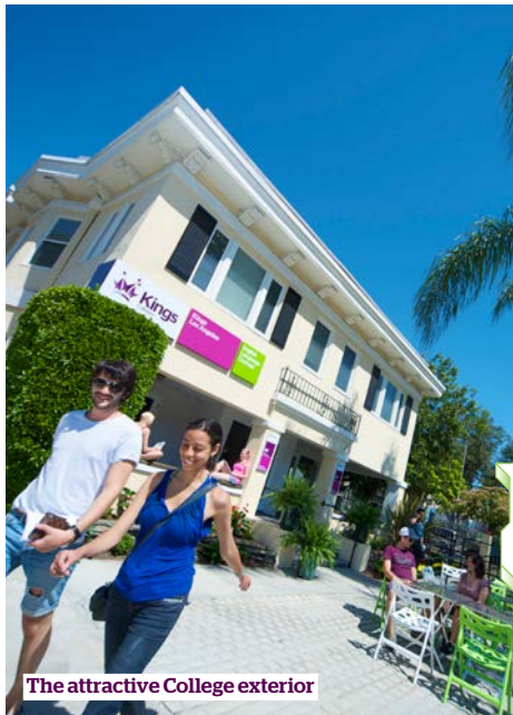
The attractive College exterior