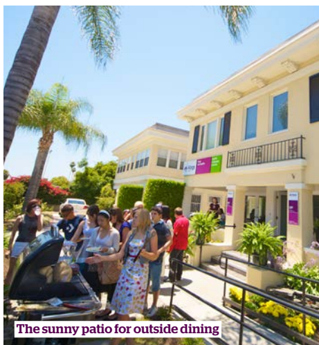
The sunny patio for outside dining