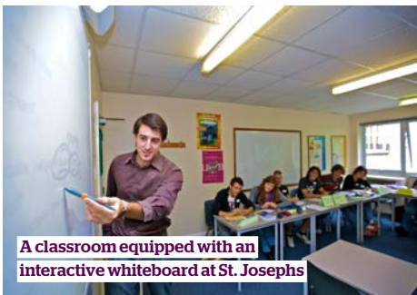
A classroom equipped with an interactive whiteboard at St. Josephs