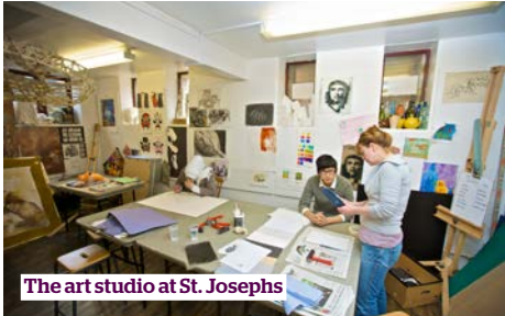
The art studio at St. Josephs