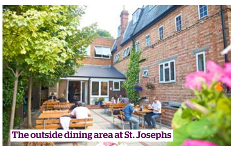
The outside dining area at St. Josephs