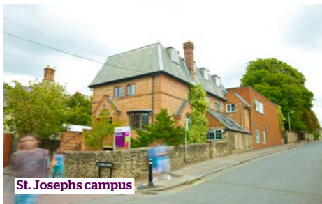
St. Josephs campus

Kings Oxford consists of two fantastic campuses - St. Michaels in the city centre, and St. Josephs in the popular area of Cowley, just 20 minutes by bus from the centre. Both campuses offer spacious, well-equipped classrooms, and there is even a dedicated art studio at St. Josephs. Whereas St. Michaels offers a bright, compact and modern space in the heart of the city, St. Josephs provides a larger, more traditional college environment which is more self-contained.