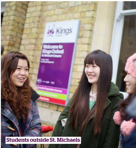
Students outside St. Michaels