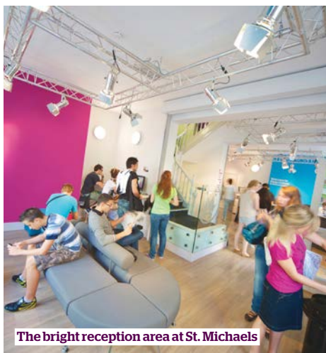
The bright reception area at St. Michaels

Kings Oxford consists of two fantastic campuses - St. Michaels in the city centre, and St. Josephs in the popular area of Cowley, just 20 minutes by bus from the centre. Both campuses offer spacious, well-equipped classrooms, and there is even a dedicated art studio at St. Josephs. Whereas St. Michaels offers a bright, compact and modern space in the heart of the city, St. Josephs provides a larger, more traditional college environment which is more self-contained.