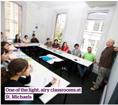
One of the light, airy classrooms at St. Michaels