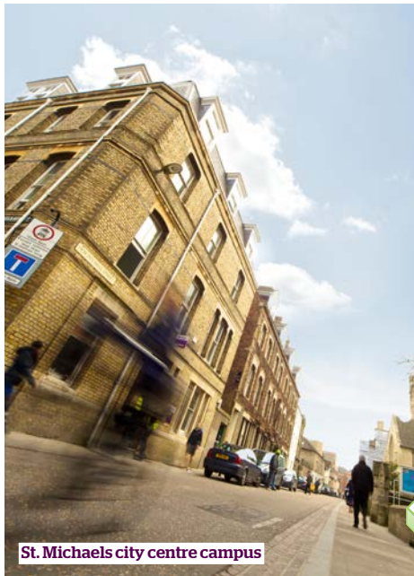
St. Michaels city centre campus