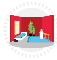
Flat & House Share